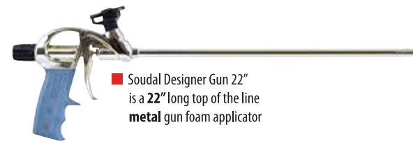
■ Soudal Designer Gun 22" is a 22" long top of the line metal gun foam applicator