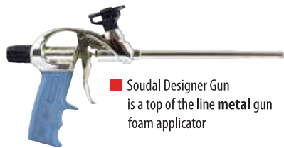
■ Soudal Designer Gun is a top of the line metal gun foam applicator