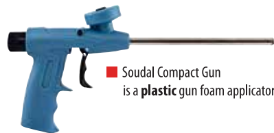
■ Soudal Compact Gun is a plastic gun foam applicator